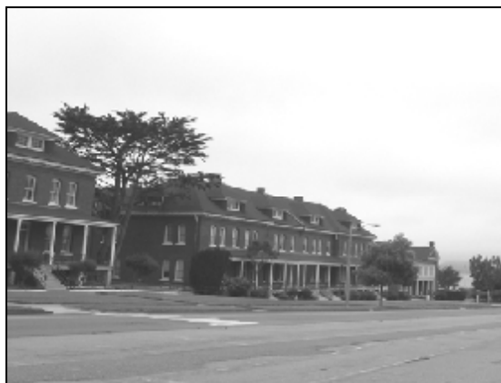
Historic structures within the Presidio

In 1991, Caltrans requested that the San Francisco Board of Supervisors revisit the most recent design concepts for Doyle Drive. The Supervisors responded with the establishment of the Doyle Drive Task Force, consisting of representatives from various local governments and public and private organizations. The Task Force considered design alternatives, developed a consensus on a preferred alternative, and in 1993 issued the Report of the Doyle Drive Task Force , which proposed a scenic parkway through the Presidio.