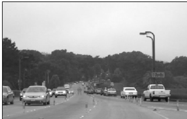
View of Doyle Drive looking west

The study also emphasized that the Doyle Drive replacement be designed as a parkway. Other important recommendations included building a transit center, and introducing transportation systems management and intelligent transportation systems technology, such as roadway surveillance cameras and real-time transit information kiosks.